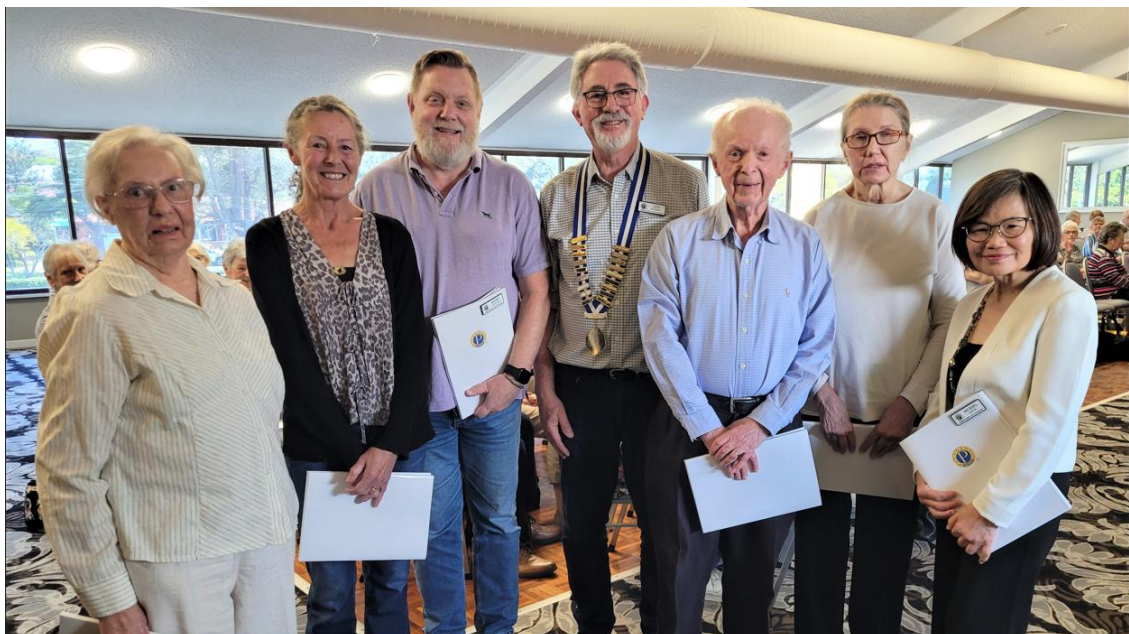
6 new members were inducted into the Club