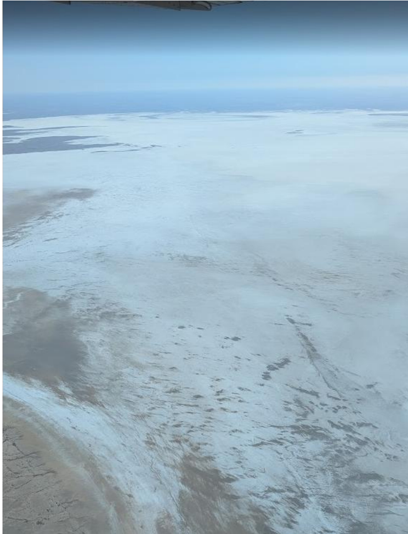
Lake Eyre South - Still no water despite the heavy Qld rains