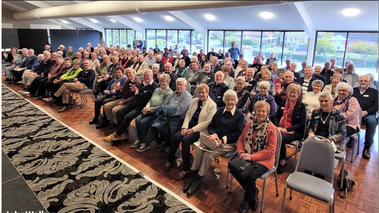
Our members – how great it is to get together!