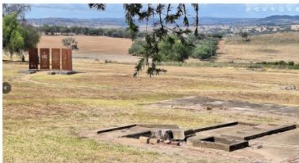
Cowra POW campsite