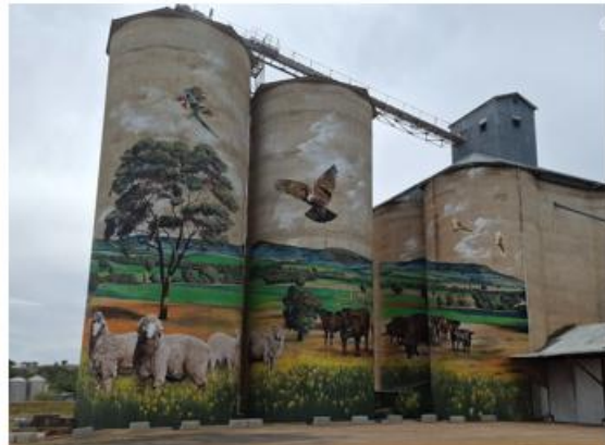
Grenfell painted silos