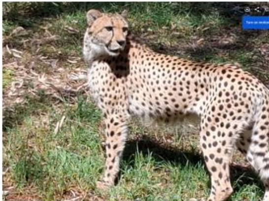
Cheetah – Western Plains Zoo