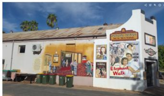
Murals at Eugowra